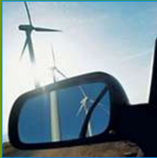
EE in Maritime