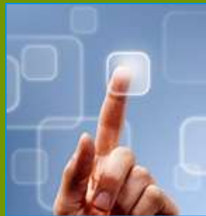
R&D and innovation